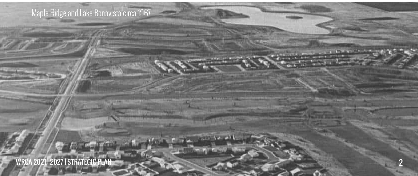
Maple Ridge and Lake Bonavista circa 1967

1 Based on the City of Calgary’s 2016 census and projections for Maple Ridge and Willow Park.